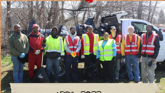
APRIL 2022 ROBBINS SPRING CLEAN-UP