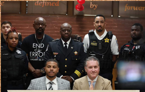
MAY 2022 RPD CONTRACT AGREEMENT