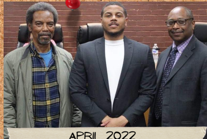
APRIL 2022 ROBBINS WATER INFRASTRUCTURE RESOLUTION