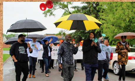
MAY 2022 MINISTERS ALLIANCE AND ROBBINS UNITED PEACE WALK