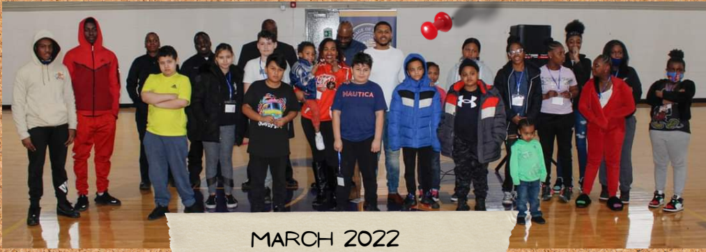
MARCH 2022 ROBBINS YOUTH RALLY